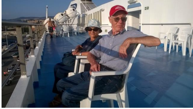
La Mazza Concetta Maglio, bangera Novara di Sicilia san 1936 Awirilikalo tile 18.